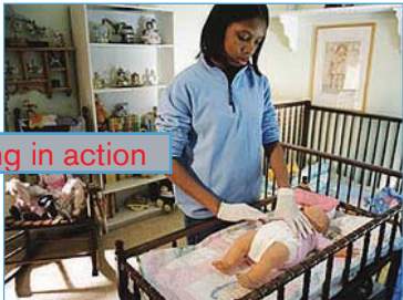
training in action