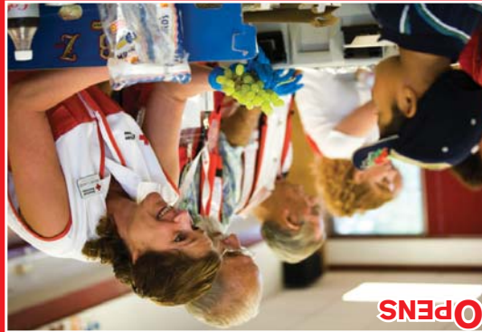
VOLUNTEER RESOURCE CENTER OPENS

Texas launched the first Volunteer Resource Center (VRC). The Northwest Recreation Center at 2913 Northland Drive in Austin was transformed from a neighborhood meeting place to a bustling hive of volunteerism, as the City of Austin and the American Red Cross of Central